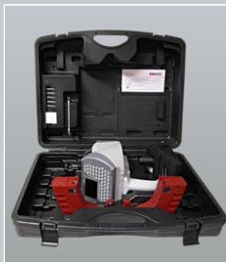
Hard protective case

Those who need to code a lot of information on small space are able to mark a Data Matrix code. You can either type in the letters on a keyboard or transfer them by one of the existing interfaces.