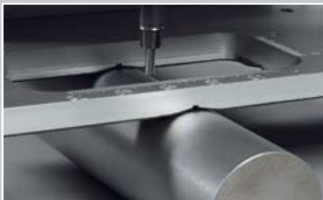
Optional work angle with prism

The hand-held and compact designed CNC marking systems FlyMarker ® XL MOBIL, STATION and COMBI are featured by their easy handling. They can be used without any knowledge of a programmer: